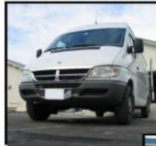
MAX BMW's new Freightliner 2500 provides secure & enclosed motorcycle transport.